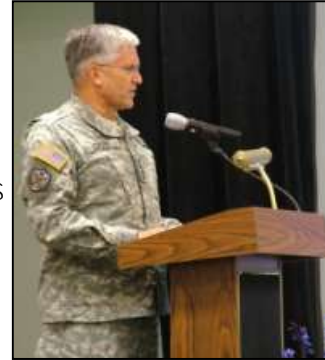
Chief of Staff of the Army General George W. Casey Jr.

...the strength of our Soldiers comes from the strength of their Families.