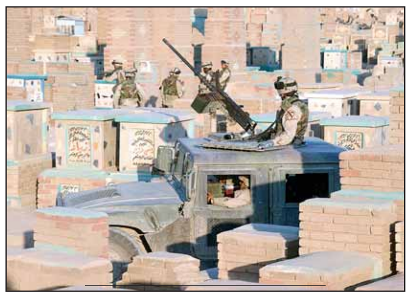
"The HMMWV's poor survivability in Iraq led the Armor Center to host a General Officers' Reconnaissance Integrated Concept Team in 2005... In general, the attendees considered the HMMWV, whether up-armored or not, an inadequate scout vehicle. They desired a better platform and wanted scout platoons capable of aggressive reconnaissance even in the presence of a hostile force. Although stealth remained the preferred method of operations, the ability to fight for information received much greater support. The M1114 remained in service as a scout platform — but only through the absence of an alternate vehicle."

In 1995, the Army again commissioned the RAND Corporation to study reconnaissance at the NTC. The purpose of this study lay in determining the effectiveness of changes to heavy maneuver battalion scout platoon doctrine, materiel, and training implemented since the earlier 1987 analysis. Since that time, M3 and HMMWV platoons had replaced the interim M113 and ITV units, night-vision capabilities had improved, and considerable changes were effected in training to ensure scouts did not prematurely engage in combat. The new study found that scouts engaged in fewer firefights, tended to survive longer and complete more missions, and benefited from better operational readiness