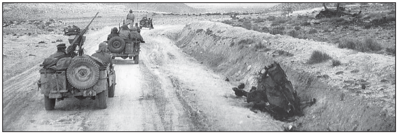
"During World War II, unarmored jeeps equipped the scout platoons of tank and armored infantry battalions. Light and mobile, the jeep nevertheless suffered from survivability issues similar to those more recently experienced by HMMWVs. In response, maneuver battalions augmented their scout platoons with tanks to overwatch the jeeps and provide a measure of combat power."

mix provided each section an antitank capability suited to operations against mechanized Warsaw Pact forces. However, the overcrowded ITVs struggled to keep pace with the M113s and suffered from low operational readiness. Moreover, the entire platoon proved slower than the Abrams tanks, which also began to equip heavy maneuver battalions in the 1980s.<sup>2</sup>