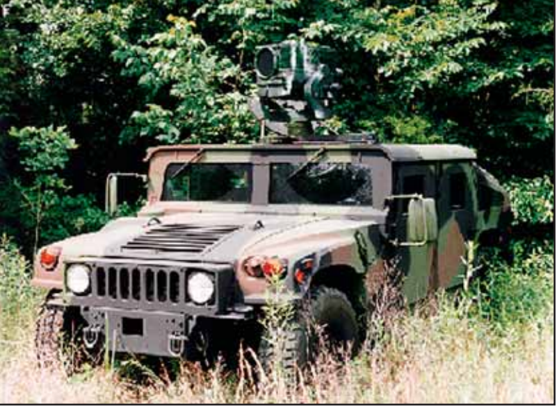
"The fielding of digital systems associated with Force XXI offered the promise of greater capability. The future battle command brigade and below (FBCB2) and the LRAS3 provided enhanced situational awareness and a greatly improved ability to identify enemy activities from afar. These systems permitted scout platoons to maneuver more effectively and observe enemy activity while reducing the risk of detection and destruction. However, fielding occurred slowly and came at a cost."

The onset of Army Transformation in 1999 triggered a new series of force structure changes intended to improve deployabil-