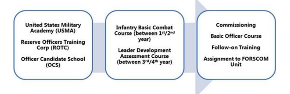
Figure 3. The adaptation of pre-existing TRADOC courses prior to an officers' assignment to a FORSCOM unit.

Another way to improve team-building would require minor adaptations to current Army TRADOC courses. LDAC is on the right track with a reduction in the number of formal evaluations from six to four. The intent is to allow cadets to experiment with different leadership styles, alleviating their focus on continuous assessments. Expanding this direction to include additional small-unit leadership challenges without formal evaluations would benefit young leaders, similar to the methods used in the French Commando Course. Furthermore, the addition of more demanding tasks, obstacles and missions to strain cadets to a point of physical and mental discomfort would further enhance leadership and team-building development.