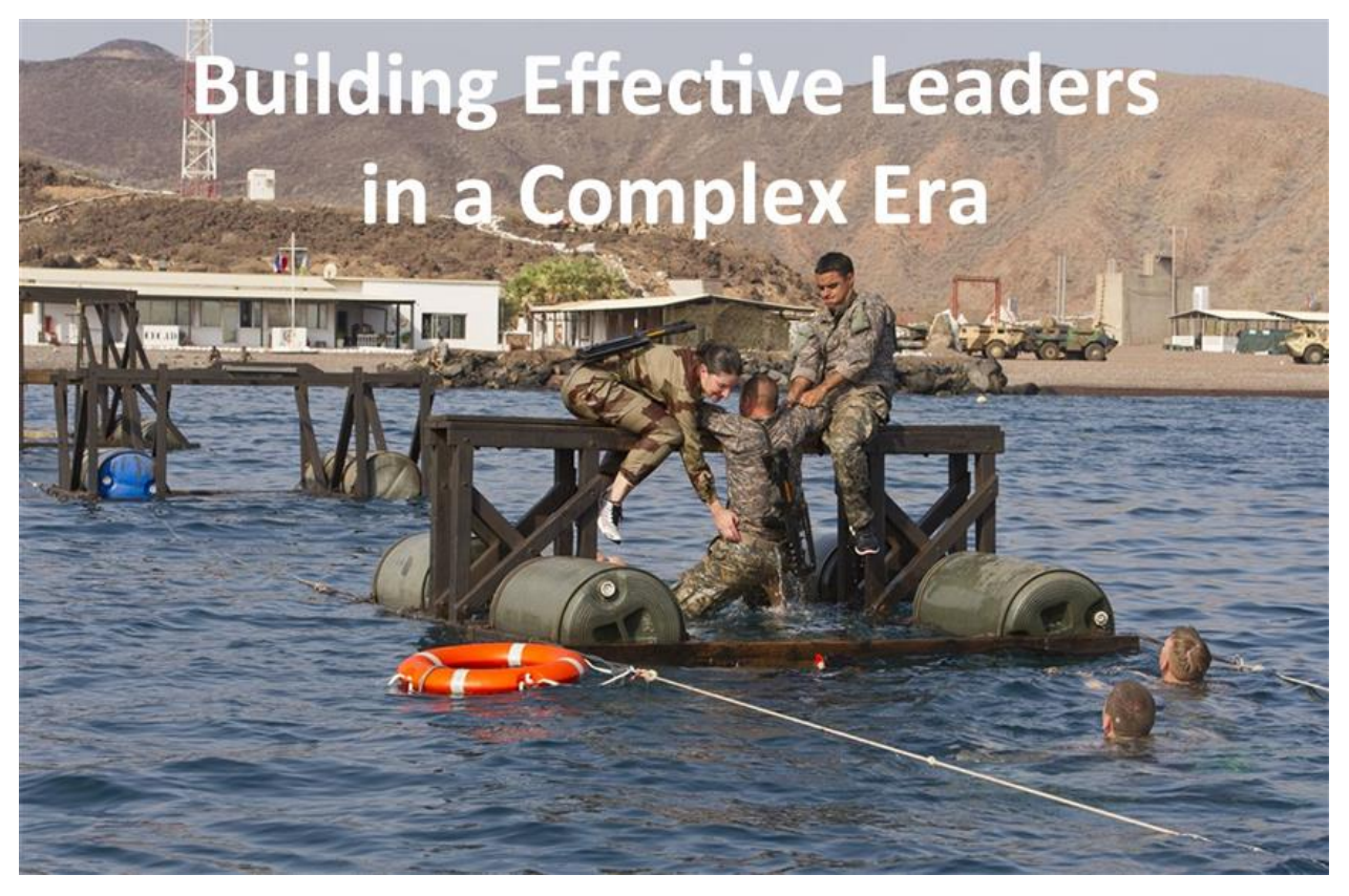
French and U.S. service members overcome an obstacle at the 5<sup>th</sup> French Marines Desert Commando Course at Arta Beach, Djibouti.