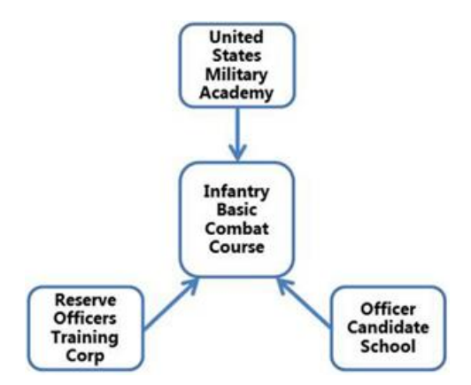
Figure 2. The expansion of commissioning requirements, incorporating the Infantry Basic Combat Course into all three commissioning sources.

Another way to improve team-building would require minor adaptations to current Army TRADOC courses. LDAC is on the right track with a reduction in the number of formal evaluations from six to four. The intent is to allow cadets to experiment with different leadership styles, alleviating their focus on continuous assessments. Expanding this direction to include additional small-unit leadership challenges without formal evaluations would benefit young leaders, similar to the methods used in the French Commando Course. Furthermore, the addition of more demanding tasks, obstacles and missions to strain cadets to a point of physical and mental discomfort would further enhance leadership and team-building development.