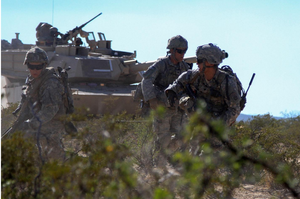
Figure 1. 82 nd Airborne paratroopers integrate Armor vehicles to support combined-arms training. Infantry brigade combat teams (BCTs) soon will have organic light-armor mobile protected firepower (MPF) companies to provide them with more firepower to counter near-peer threats.