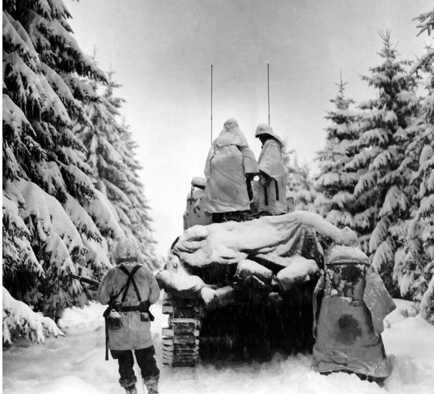
Figure 2. Soldiers from 740 th Tank Battalion and 82 nd Airborne Division push through the snow near Herresbach, Belgium, Jan. 28, 1945.

The 3 rd Platoon from Company C of the 740 th and 3 rd Battalion of the 504 th would lead the attack. Snow and fog covered the advance down a single narrow trail. Single tanks led paratroopers marching in columns of two spaced at platoon interval. 8