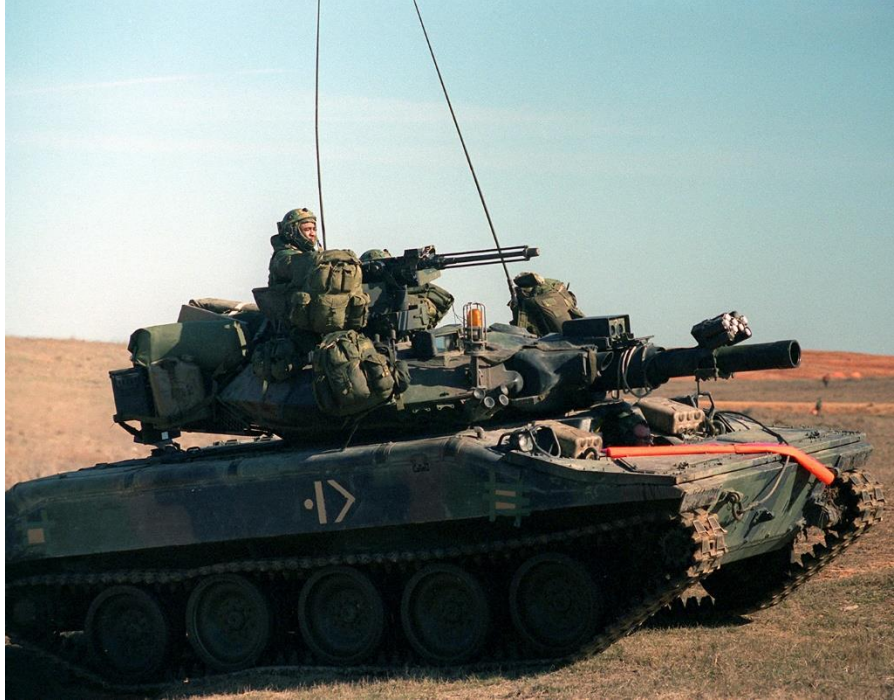
Figure 4. A Sheridan tank supporting the 82 nd Airborne rotation at JRTC patrols the forward landing strip in Cortina.

After encountering minimal resistance, the platoon was attached to 2 nd Battalion, 501 st PIR, and assisted in repelling multiple mechanized-infantry counterattacks over three days until it was finally destroyed by enemy armor.