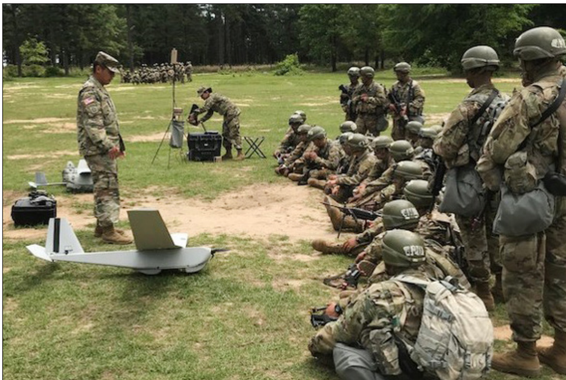
Instructors from the Small Unmanned Aerial Systems Master Trainer Course (3rd Squadron, 16th Cavalry Regiment) familiarize Infantry One Station Unit trainees with UAS models in the U.S. Army arsenal.

In April 2018, Delta Company, 2nd Battalion, 58th Infantry Regiment, 198th Infantry Brigade, which conducts Infantry One Station Unit Training (OSUT), began implementing UAS training during the Advanced Individual Training (AIT) portion’s culminating field training exercise (FTX) over three successive 14-week training cycles. The purpose of this article is to provide a brief overview of the experimentation phase, lessons learned, and proposed methods to begin institutionalizing UAS training for the new generation of Soldiers at the company level.