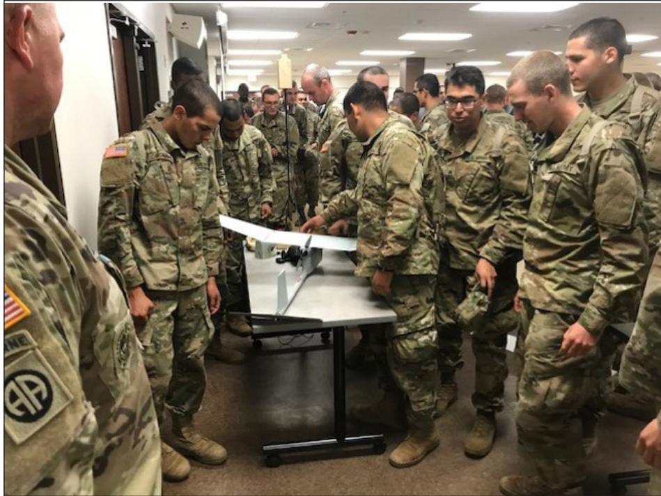
During Trial 3, trainees get a closer look at a Raven UAS during formal classroom instruction that occurred a week before their final field exercise.

5 Eugene K. Chow, "What Happens When America's Enemies Attack with Their Own Drones?" The National Interest , 11 March 2018, accessed from nationalinterest.org/blog/the-buzz/what-happens-when-americas-enemies-attack-their-own-drones-24805 .