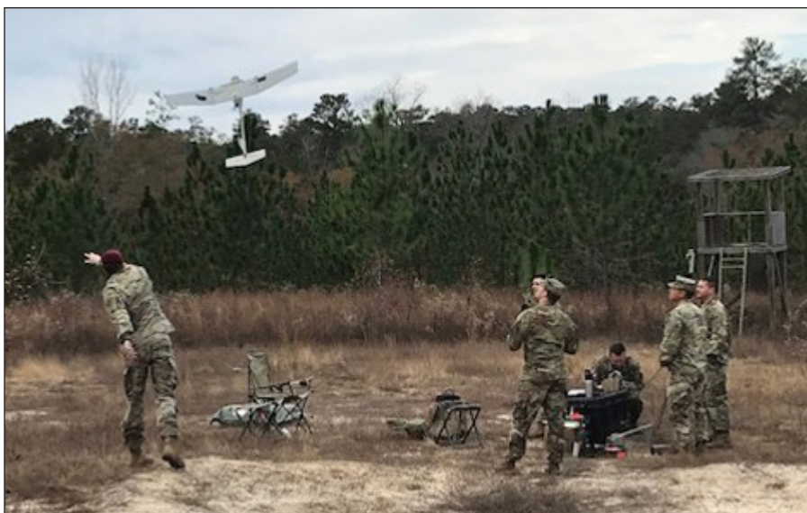
Instructors from the 3rd Squadron, 16th Cavalry Regiment train SUAS-MT students on UAS operations while simultaneously providing intelligence to Infantry OSUT trainee platoons which were completing their culminating field training exercise.

On 25 April 2018, Delta Company, 2-58 IN began its first trial run with the intent to expose trainees to the perils of enemy-controlled air and the advantages of friendly controlled air with surveillance assets. The SUAS-MT instructors