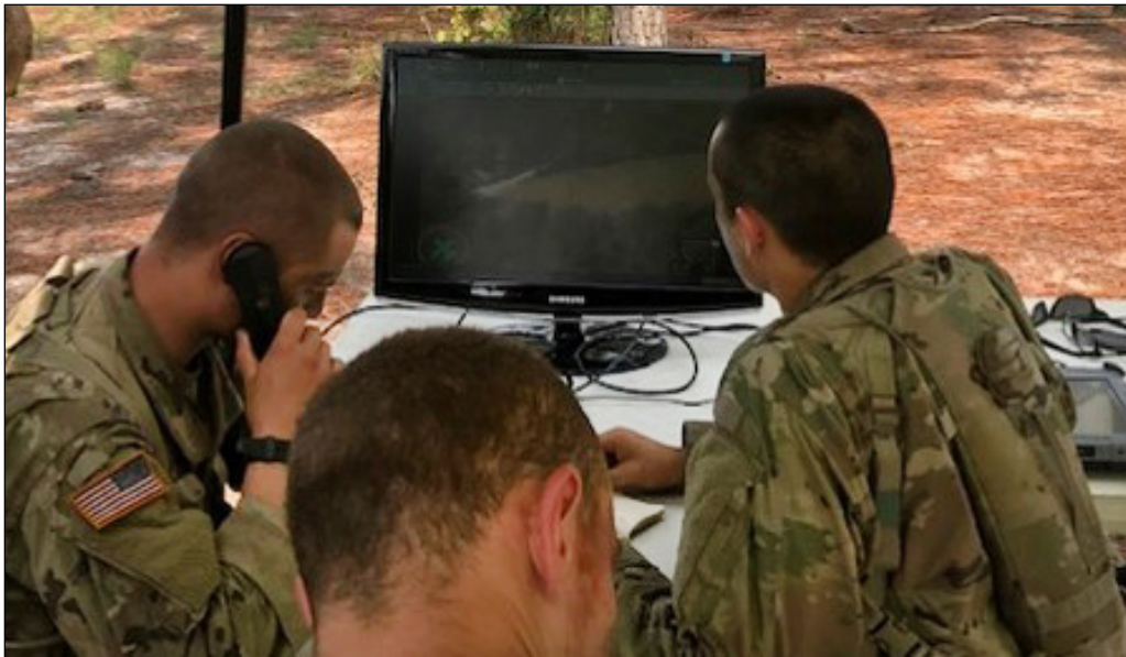
Trainees from Delta Company, 2nd Battalion, 58th Infantry Regiment, observe a live feed from friendly UAS assets and provide immediate feedback to units conducting missions.

The big takeaway from Trial 2 was the need to engage more trainees and increase the UAS assets in order to add two more deliberate attack missions on an enemy objective. Trainees not engaged in a mission could serve as OPFOR and company CP FM radio operators. The remaining trainees who were not directly tasked could observe the UAS live feed and experience the value of Blue Air surveillance. In addition, the drill sergeants requested that the formal hour block of instruction occur prior to the day of training to allow for more rehearsals and preparation time in the morning before beginning the missions.