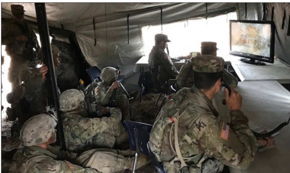
Trainees from Delta Company, 2nd Battalion, 58th Infantry Regiment, observe a live feed from friendly UAS assets and then provide immediate feedback to units conducting missions.