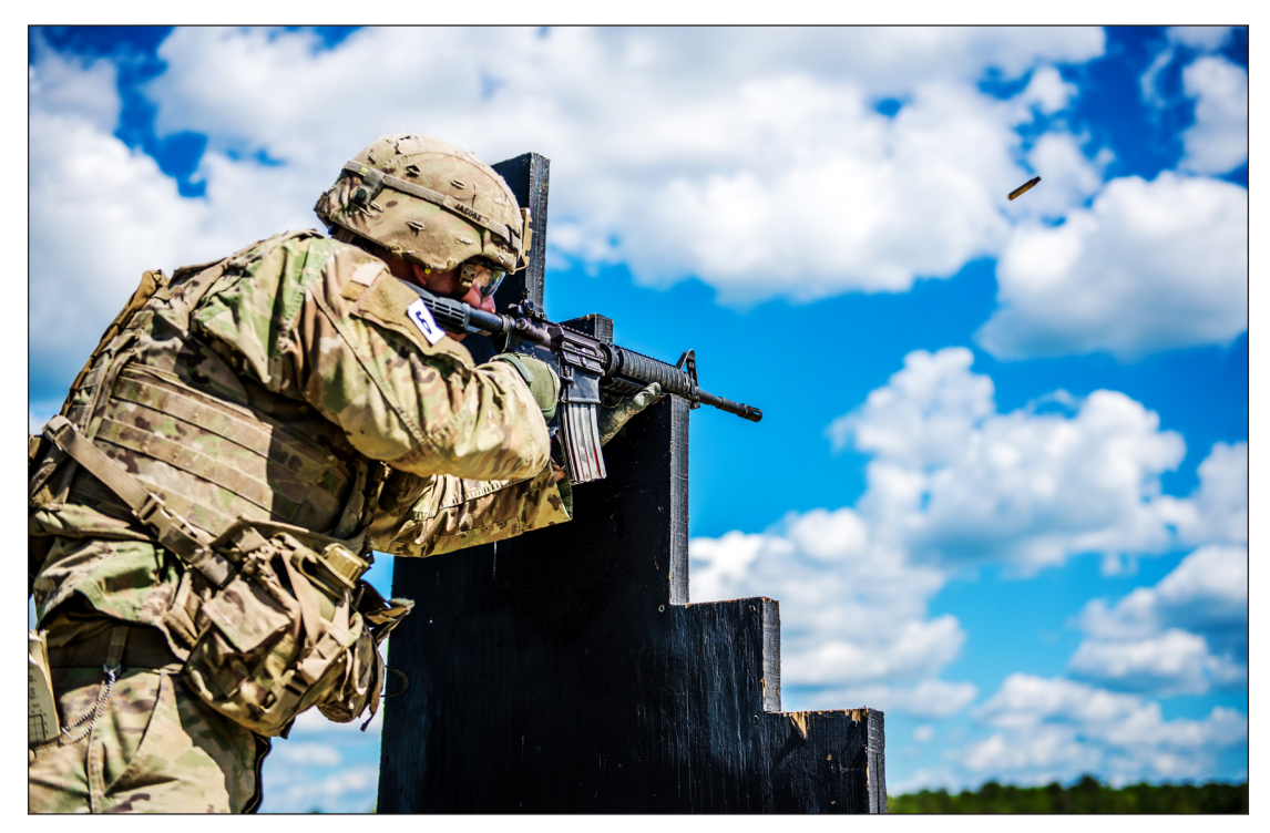
A Soldier participating in the 2019 Best Mortar Competition completes the new qualification table on 10 April.

TC 3-20.40 applies to all individual weapons and serves as a resource to help commanders, staff, and NCOs understand the requirements for planning, preparing, executing, and assessing training through qualification. TC