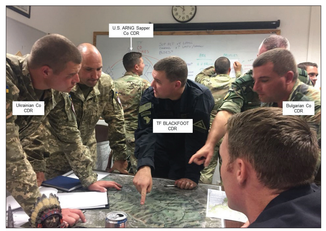
During Saber Junction 18, commanders discuss the effects of the terrain on the upcoming operation. Collaborative planning amongst the task force leadership is essential.

The liaison teams greatly benefited the entire planning, preparation, and execution process. They facilitated the completion of reception, staging, onward movement, and integration (RSOI) tasks; coordination with the TF