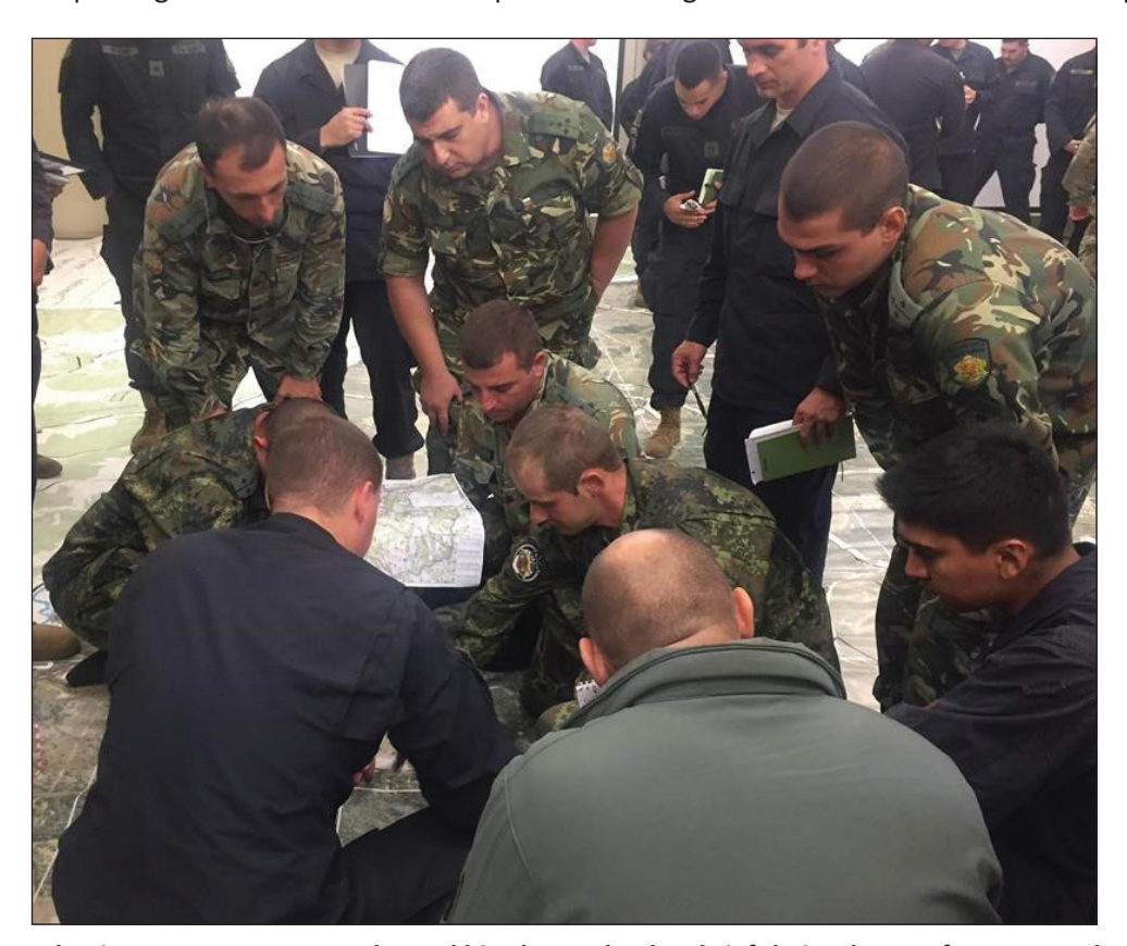
The Bulgarian company commander and his platoon leaders brief their scheme of maneuver during the task force rehearsal. Standing over the Bulgarians is the liaison officer from the attached ARNG sapper company who oversaw the Bulgarian company operations.

Our rehearsals created a shared understanding of the plan across the TF. Discussion of several contingencies during the rehearsals built flexibility into the plan. During our attack, it became evident that the two hours we spent during the rehearsals set us up for success. Reconnaissance elements from our battalion determined several hours prior to our attack that our objective needed to shift 1.5 kilometers beyond our initial objective location. We had rehearsed a similar contingency and so were able to adjust our plan rapidly without losing the shared understanding we had developed. As a result, TF Blackfoot achieved its mission by breaching the enemy's main defensive line and passing the battalion's decisive operation through the breach with its full combat power intact.