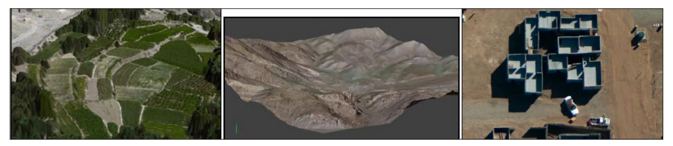
Figure 2 — Examples of BuckEye Products