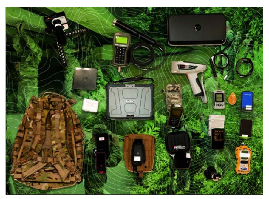
The ENFIRE program modernizes and expedites the collection and dissemination of reconnaissance, construction, facilities planning and project management data for U.S. Army and U.S. Marine Corps engineers.

warfighting functions, and military leaders that leverage their geospatial engineers will have a COP that spans the continuum of geographic space. Whether operating in the strategic support area or the deep maneuver area, leaders and staff that maximize the human potential of their 12Ys and 125Ds will undoubtably control the terrain.