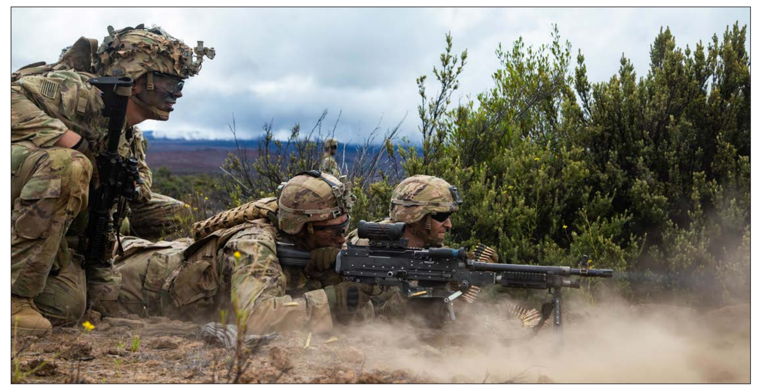
A gun team with 1st Battalion, 27th Infantry Regiment "Wolfhounds," 2nd Infantry Brigade Combat Team, 25th Infantry Division, lays suppressing fire during an FSCX on 17 November 2019. The FSCX is one of the most realistic training events offered, allowing junior leaders to gain practical experience with calling coordinated fire missions and observing fires effects when paired with a maneuver element.

Lastly, inclusion of the CAB was critical to the quality of the operation. C/T commanders controlled AH-64s for the entirety of the operation. Due to the gun target line, they were forced to decide when to commit attack aviation and when to hold them back while employing indirect fire systems. Air assault operations were a secondary training objective for the FSCX, but we found significant development and learning