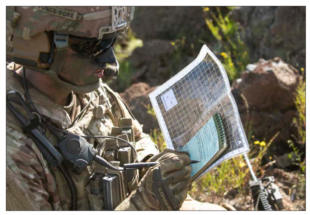
A Soldier with the 2nd Infantry Brigade Combat Team, 25th Infantry Division plans out fire missions during a fire support coordination exercise on 19 November 2019 at Pohakuloa Training Area.

to leaders about developing and becoming adaptive, flexible officers and NCOs who are prepared to lead our country's Soldiers to win in battle. This exercise was designed to test this very concept. The brigade leadership passionately believed combat should not be the first time junior leaders should control echeloned assets, feel and see the effects of large munitions at close range, and be placed under a tremendous amount of stress. As an example, the first time many of the senior leaders within the brigade experienced live ordnance drops from an aircraft was in combat as young officers and NCOs.