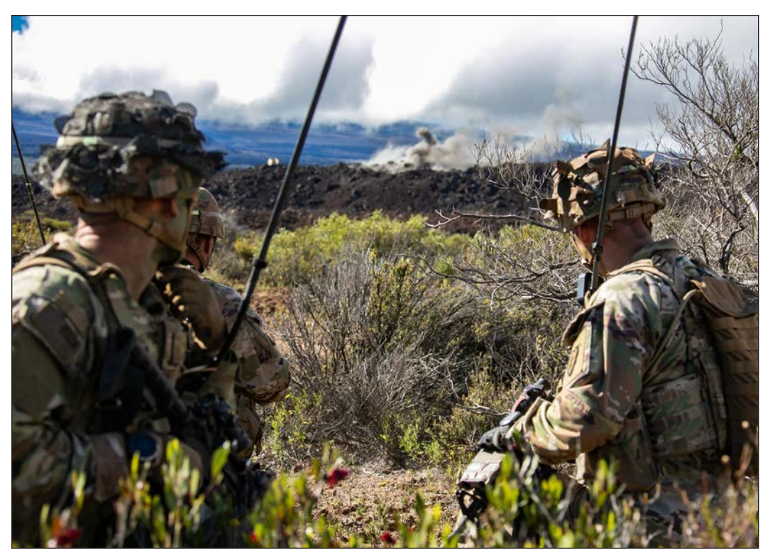
Soldiers with the 1st Battalion, 27th Infantry Regiment observe incoming fires effects during an FSCX on 18 November 2019 at the Pohakuloa Training Area.

in this area. As an IBCT, all leaders must be comfortable conducting air assault planning and execution. All C/T CARs included lift and attack aviation pilots, which increased shared understanding and added tremendous training value.