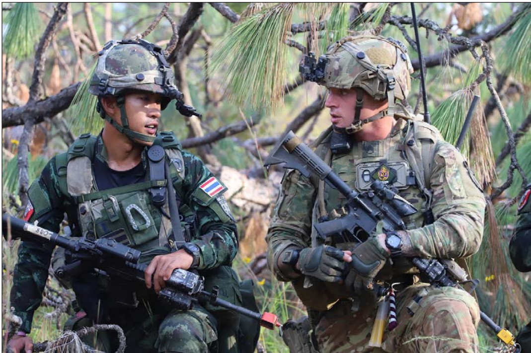
Advisors from 5th Security Force Assistance Brigade work with allied partners from the Indo-Pacific Command region at the Joint Readiness Training Center at Fort Polk, LA.