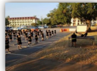
BLC Physical Readiness Training