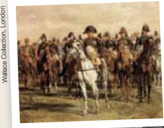
Napoleon and His Staff (1868), by Jean-Louis- Ernest Meissonier

lowers firmly believe that military history cannot provide any valuable lesson for today or the