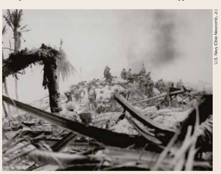
Marines storm Tarawa in Gilbert Islands, November 1943

ndupress.ndu.edu issue 57, 2<sup>d</sup> quarter 2010 / JFQ 127