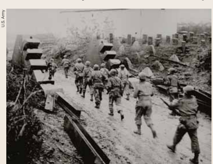
U.S. Soldiers march into Germany through the Siegfried Line, 1945

The emulation of historical examples has often been used to save time and resources or to win bureaucratic battles in support of a