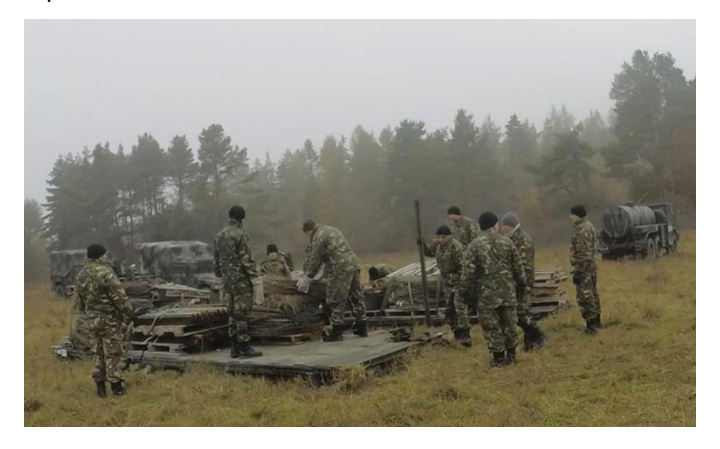
Figure 4. Soldiers from 191st Infantry Battalion (Romania) prepare to relocate the unit trains by loading Class IV onto flat racks at JMRC.

It is critical for the brigade to understand the transportation capacity and compatibility of all systems in the task force to successfully distribute Class IV. Once logistic planners understand available assets, they must develop a plan that accounts for the capabilities and limitations of each unit.