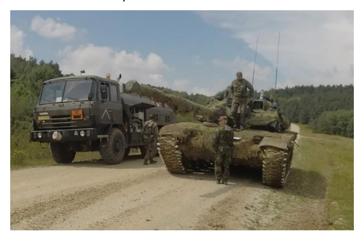
Figure 3. Soldiers from 74<sup>th</sup> CSS Company (Czech Republic) prepare to conduct resupply-on-the-move operations during a rotation at JMRC.

retail, to each unit in the task force. The brigade managed fuel distribution using a complex sustainment synchronization matrix, but fuel distribution expended more time than it would have with a single-fuel system.