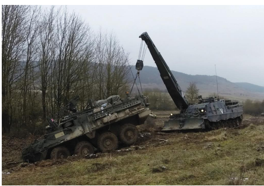
Figure 5. A Royal Netherlands Army BPz3 Buffel recovers a Stryker at JMRC, Hohenfels, Germany.

Echelon of support also affects replacement of end-item equipment since a TAB-77 cannot be procured through U.S. channels. This requires the logisticians to have an intimate understanding of equipment in the task force and thorough coordination with the multinational division-sustainment cell.