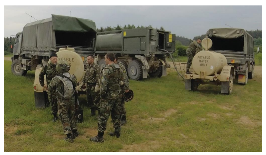
Figure 2. 3<sup>rd</sup> Brigade Support Battalion Soldiers deliver water to Romanian and Bulgarian Soldiers at JMRC, Hohenfels, Germany.

Class I (food, rations and water). Support requirements to multinational battalions range from completely dependent for all Class I needs to entirely self-supporting. When self-supported, multinational battalions conduct sustainment along national lines, failing to sustain attachments whose nationality differs from the nationality of the battalion headquarters. This forces a brigade-support battalion (BSB) to provide Class I to individual companies that the multinational battalion's combat-service-support (CSS) company does not support.