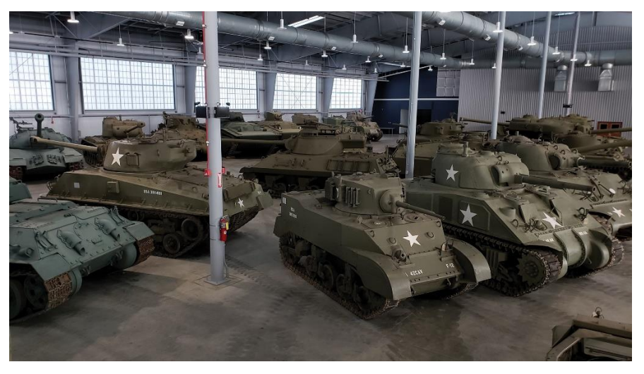
Figure 2. The TSF stores the Armor Branch's larger artifacts, such as these tanks.

the ability to co-locate all macro- and micro-artifacts. With the October 2020 completion of the larger Training Support Facility (TSF), we can now store all of our larger artifacts. We will build on this success by completing the renovation of its sister building that will house micro-artifacts, as well as the vehicle restoration shop.