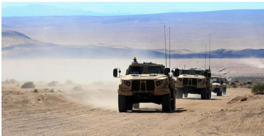
Figure 2. A Joint Light Tactical Vehicle convoy performs mounted-movement techniques in a desert environment.

The technology required for all-electric propulsion for light tactical vehicles exists today. However, the technology required to sustain these vehicles in an austere environment does not. In the future operational environment, formations employing MDO will be widely dispersed and may not have the ability for a daily logistics package to rearm/refit every unit. Semi-independent operations may last for days without external support.