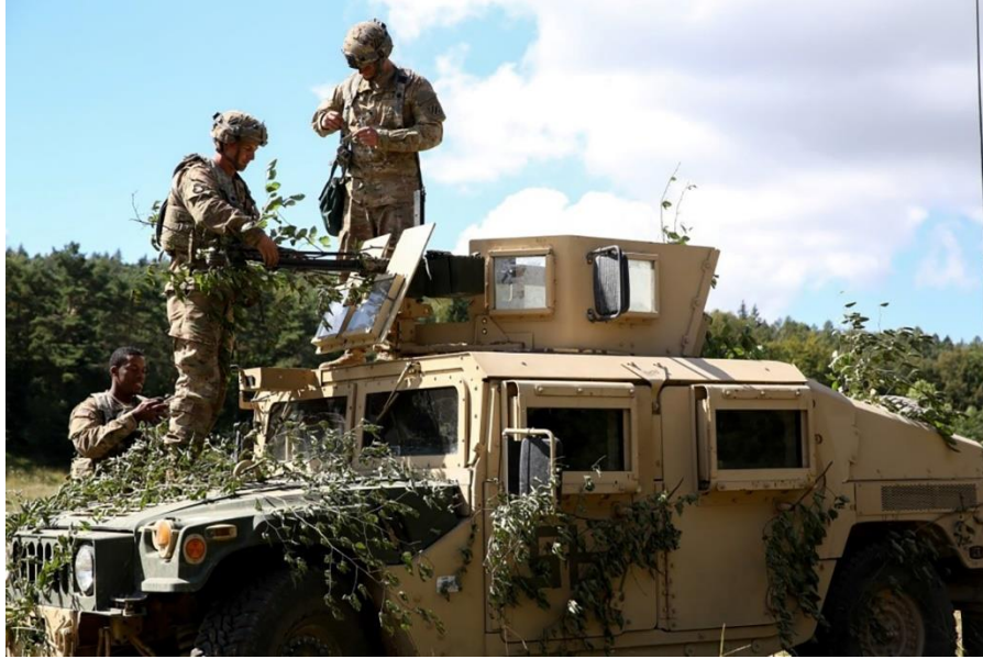
Figure 3. Soldiers finalize camouflage in preparation for a mounted reconnaissance mission.