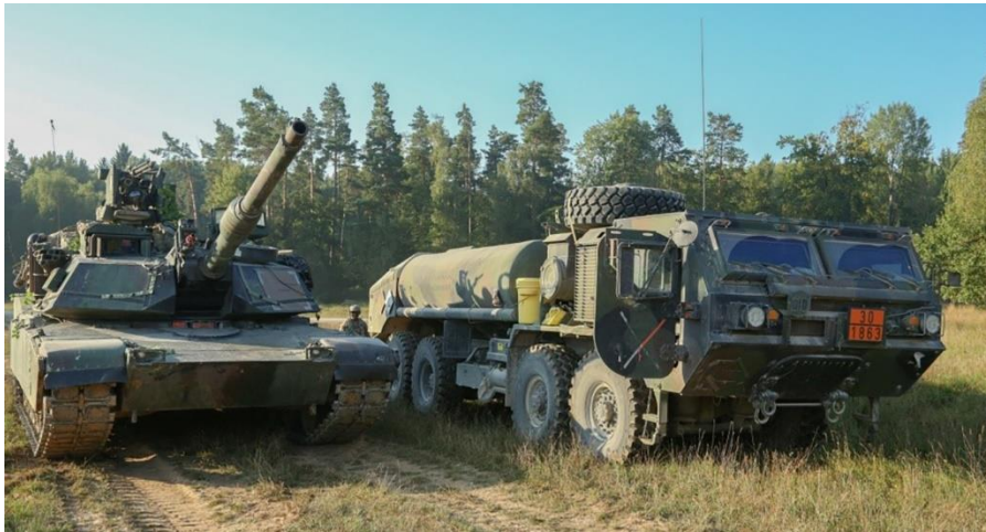
Figure 1. A Heavy Expanded-Mobility Tactical Truck fueler prepares to conduct refuel operations in an austere environment.

A significant vulnerability of forward-deployed ground combat forces is their dependence on bulk-petroleum fuels. These traditional fuels are essential for maneuver forces; they power weapon-systems and command-and-control systems, and aid in gathering information and decision-making. Maneuver-force endurance and operational reach is determined by the ability to ensure open lines of communication, with a supply of bulk petroleum readily available.