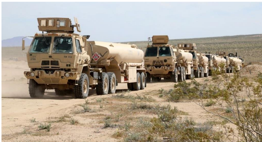
Figure 4. A fuel convoy moves to provide fuel to combat forces in support of sustainment operations.