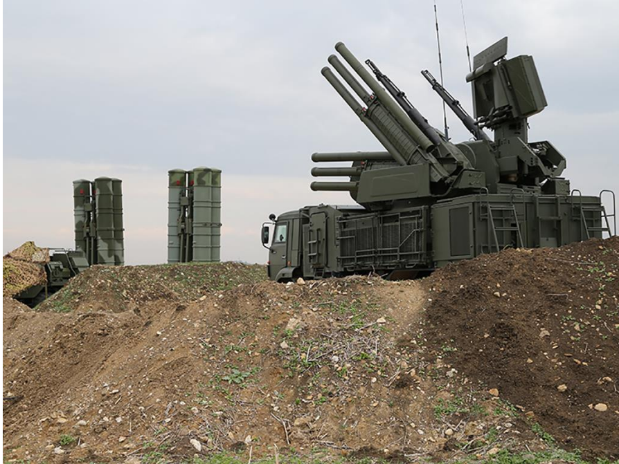
Figure 1. A Russian air-defense battery in December 2015 in the Syrian Arab Republic. (A Pantsir-S1 close-range defense system and two launch vehicles for S-400 long-distance flight missiles at Latakia.) At the appointed time, the Russian unit conducting a reconnaissance-in-force launches an attack during a brief fire preparation. Under cover of fire of artillery and weapons in direct lay, battalion (company) subunits swiftly attack the enemy, break into the forward edge of the enemy defense, seize and consolidate at designated lines or the lines they have reached and determine the enemy grouping, weapons and fire plan.