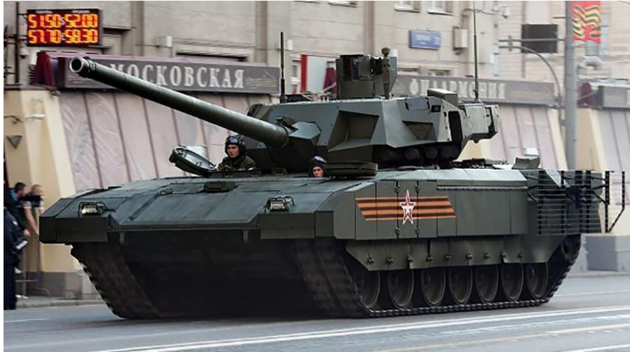
Figure 2. Russia's T-14 Armata MBT.

President Donald Trump's new national security adviser and celebrated member of the U.S. Army Armor community, LTG H.R. McMaster, summed it up best when he said, "Russians have superior artillery firepower, better combat vehicles ... should U.S. forces find themselves in a land war with Russia, they would be in for a rude, cold awakening." 7