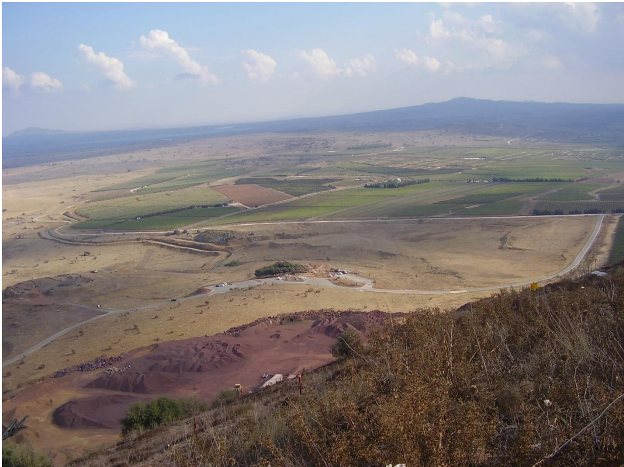
Figure 1. The battlespace, Valley of Tears, Israel.

The OZ (the Hebrew acronym for courage) 77 th Armored Battalion, commanded by LTC (later BG) Avigdor Kahalani, would conduct a classic area defense culminating with the Battle of the Valley of Tears. Despite overwhelming odds, the fight Oct. 9 turned the tide of the Golan Heights Campaign in Israel's favor.