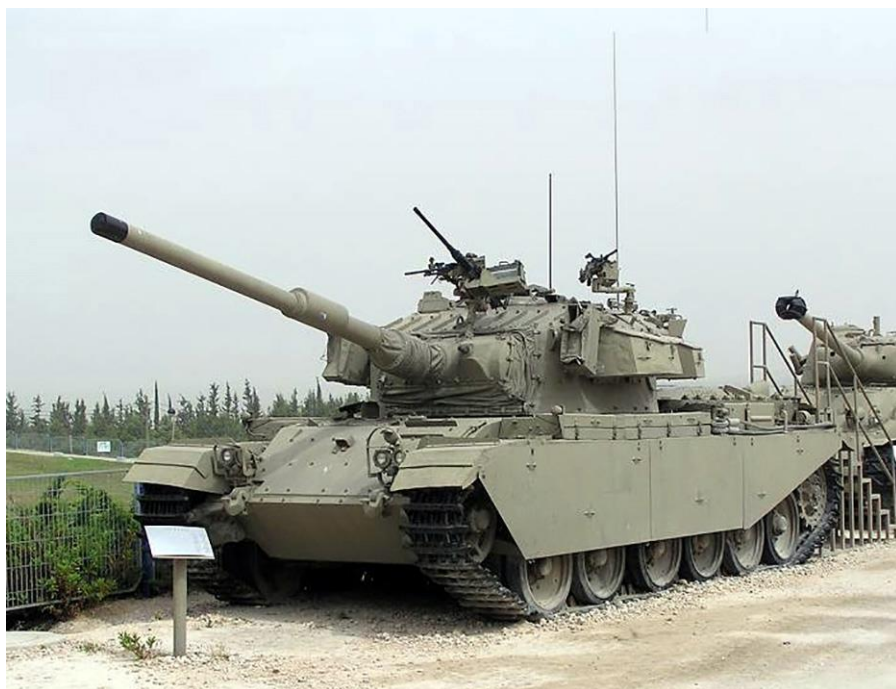
Figure 5. An improved Israeli Centurion tank at the Israeli Armored Corps Museum. This tank was considered in many respects superior to the Soviet T-54/55 the Syrians deployed in the Golan Heights Campaign.