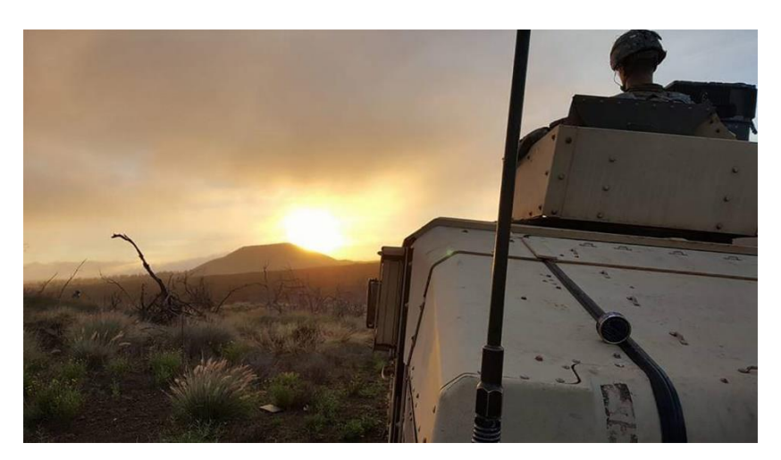
Figure 2. A scout from Troop A, 3-4 Cav, scans the horizon in search of the enemy counter-reconnaissance force in Pohakuloa Training Area on the Big Island of Hawaii during Operation Raider Strike 2015.

Forceful and deliberate. This tempo may contradict certain subject-matter experts when it comes to reconnaissance. If we examine this carefully, sensitive-site exploitation falls within this tempo. Scouts do go into built-up areas within their capable means. They do cordon off areas to gain deliberate information on the population as well as key infrastructures.