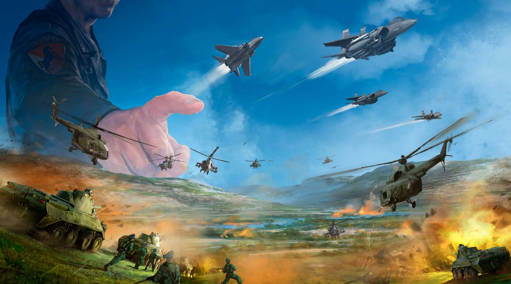
Illustration by Marc Simonetti

Artist rendering of a U.S. Army commander shaping the deep fight with lethal fires from field artillery, attack aviation, and fixed-wing aircraft. This painting is box art for Wargame: Airland Battle from Eugen Systems and published by Focus Home Interactive.