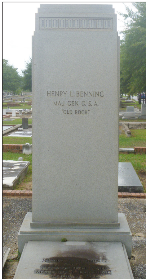
Henry Lewis Benning, nicknamed "Old Rock," died on 10 July 1875 and was buried in Linwood Cemetery in Columbus, GA.