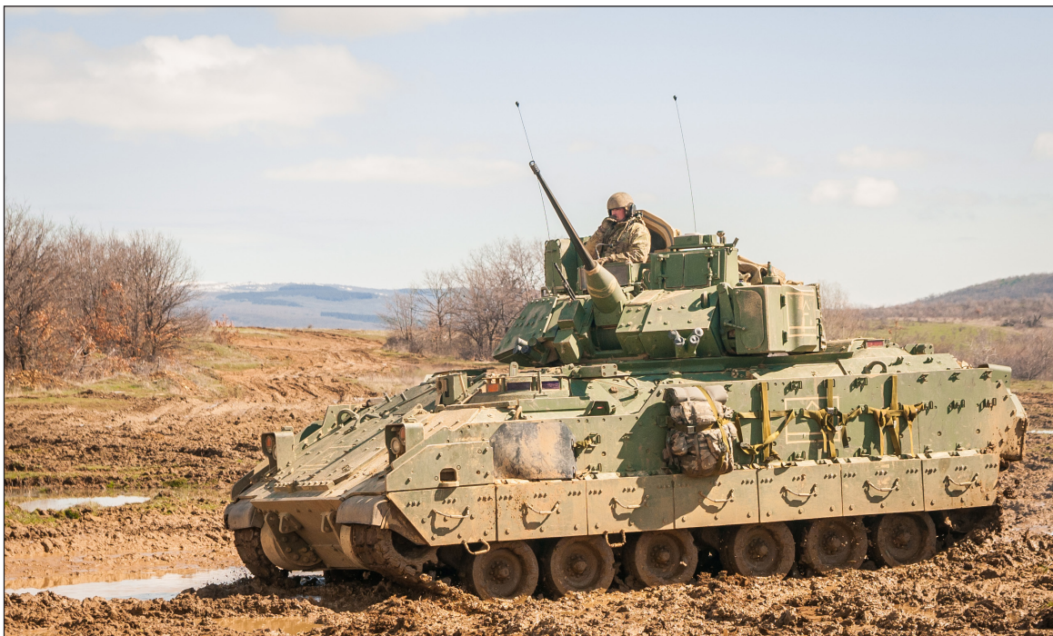
An M2 Bradley Fighting Vehicle assigned to Attack Company, 1st Battalion, 18th Infantry Regiment, traverses muddy terrain after successfully completing crew qualifications at the Novo Selo Training Area, Bulgaria, on 20 March 2018.

Army Techniques Publication (ATP) 3-21.8, Infantry Platoon and Squad , describes steps 4-6 of engagement area development (EA DEV) as fluid. 2 However, commanders recognize certain inflexible components of EA DEV — notably, that obstacles without direct fire overwatch are ineffective. Platoon leaders have noted in previous operations that obstacles are either emplaced under direct fire or they are not emplaced at all. 3 One of the steps of EA DEV — “Plan and Integrate Obstacles” — proves to be a challenge at JMRC because of the speed of the fight and the need to cover multiple engagement areas. At times, the fight would develop so rapidly at JMRC that combat vehicles were