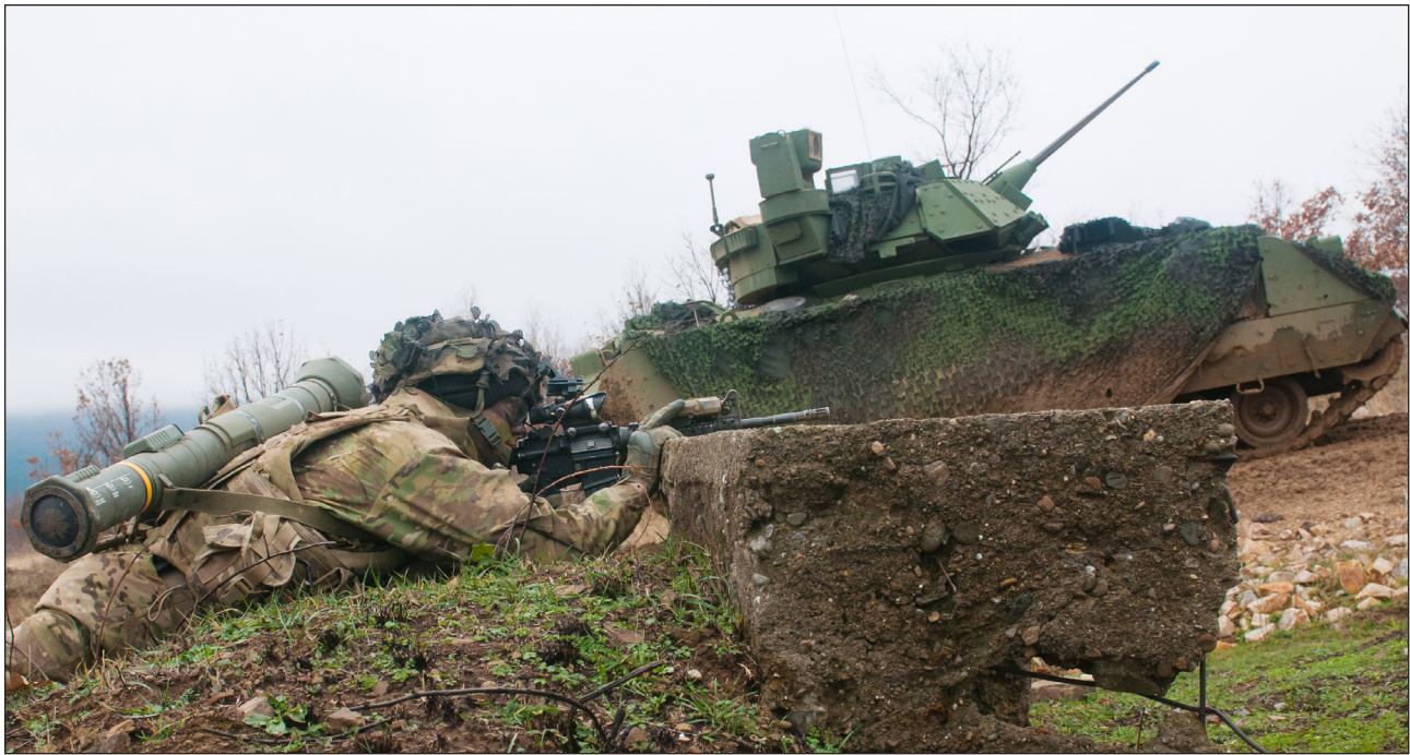
A Soldier with the 1st Battalion, 18th Infantry Regiment pulls security after dismounting a Bradley Fighting Vehicle during platoon live-fire qualifications on 18 December 2017 at the Novo Selo Training Area in Mokren, Bulgaria.

well as Stryker BCTs is a trend that occurs often at our CTCs, as evidenced in after action reviews from the National Training Center at Fort Irwin, CA. 9