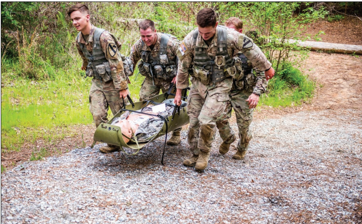
Team 4 from the 1st Cavalry Division completes the trauma lane on the first day of the competition.