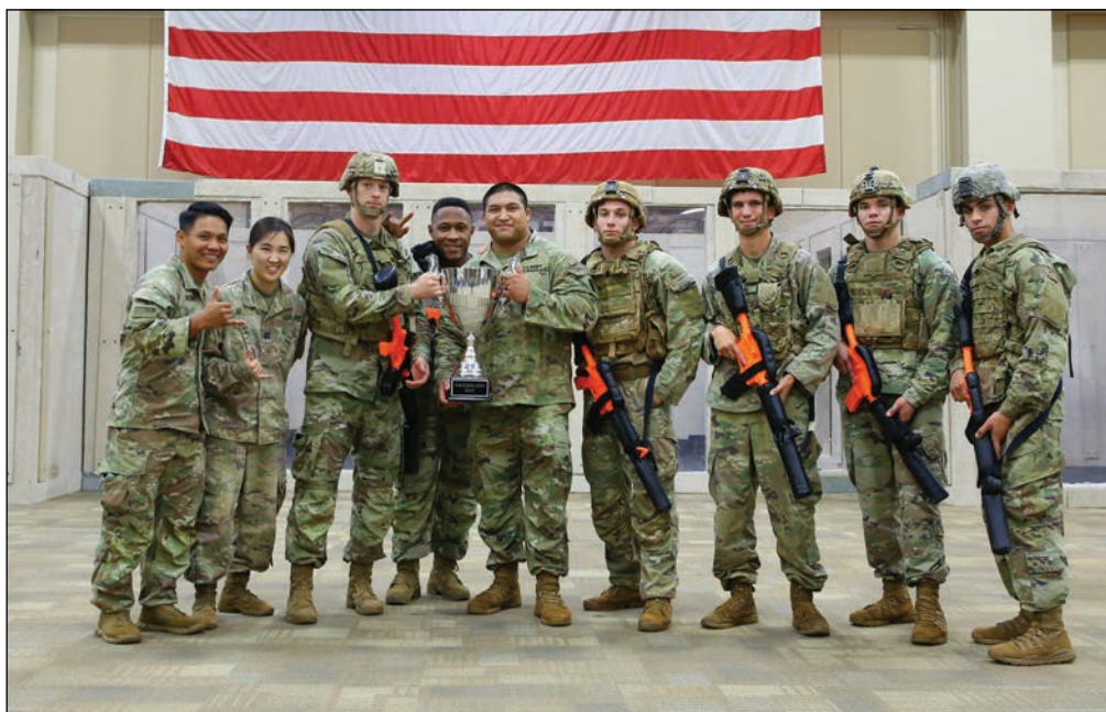
The team from the 25th Infantry Division as named overall champion of the 2019 Lacerda Cup.

View more photos from the competition at: https://www.fortbenningphotos.com/Maneuver-Center/199th-Infantry-Brigade/2019-Lacerda-Combatives-Competition .