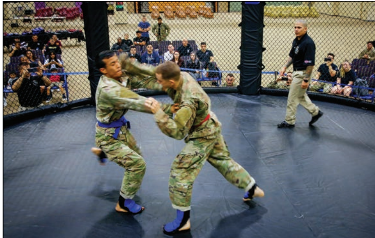
During the second day of the Lacerda Cup, two Soldiers compete in an octagon match.