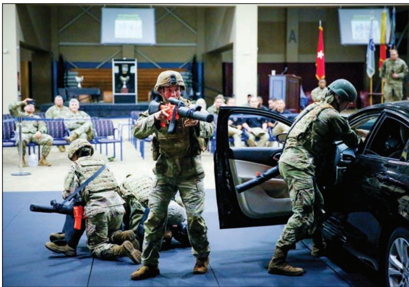
Soldiers compete in the tactical scenarios portion of the Lacerda Cup on 12 April at Freedom Hall.