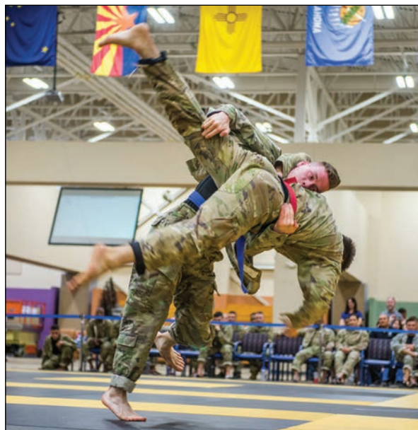
Two Soldiers grapple during the preliminary rounds of the 2019 Lacerda Cup on 10 April.