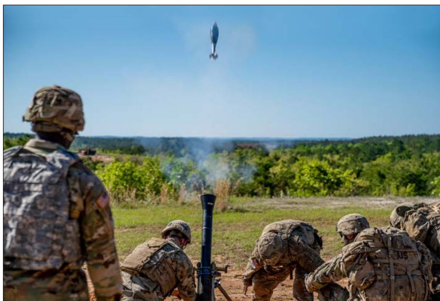
A mortar crew fires a round as part of the Best Mortar Competition live-fire exercise on 11 April at Fort Benning's Red Cloud Range.

Read more about the competition at: https://www.army.mil/article/220507/for_second_of_two_years_82nd_airborne_earns_title_of_best_mortar_crew .