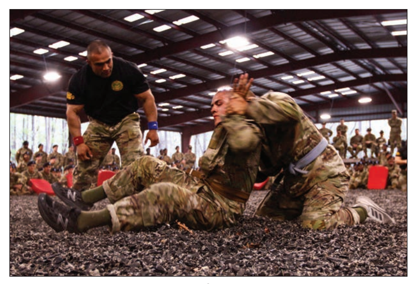
Trainees in 1st Battalion, 61st Infantry Regiment grapple during a battalion combatives tournament in April 2022 at Fort Jackson.

COVID. During this period, Soldiers arrived to their first duty assignments without any combatives experience and resulted in units having to teach these basics to newly arrived Soldiers, which delayed other essential training. This was a detriment to the force; re-introducing MACP into the BCT plan is essential.