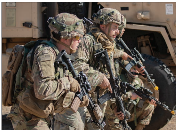
Soldiers with 3rd Battalion, 161st Infantry Regiment “Dark Rifles” pull security during a National Training Center rotation on 14 March 2021.