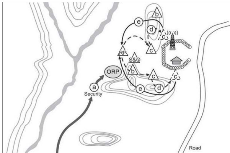
Figure 2 (Training Circular 3-21.76, Ranger Handbook)

Doctrinistas contend we have a direct-fire fratricide problem. We would if the engagement was fought two-dimensionally, like on paper or on a whiteboard. However — in the real world — distance, terrain, communication, and threat-based direct-fire control measures negate that problem. We take the additional step of breaking down and moving SBF 1 laterally to become the reserve once the Destroyers cross a specific phase line. Again, think cloverleaf.