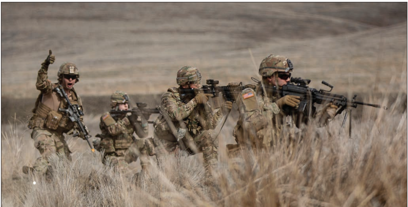
In preparation for a National Training Center rotation, Soldiers assigned to 3rd Battalion, 161st Infantry Regiment conduct tactical movement training on 4 March 2021 at Yakima Training Center, WA.

After completing squad leader certification, we implemented the Team Leader Development and Certification Program. Under the mentorship and guidance of the operations sergeant major (SGM) and command sergeant major (CSM), the squad leaders, platoon sergeants, and first sergeants planned, resourced, and executed this event entirely, making it an entirely NCO-driven event. Platoon sergeants and squad leaders developed and instructed field training courses for tasks including communication, battle drills, combat water survival, field craft, weapon characteristics, land navigation, and leadership. Team leaders executed a grueling, weeklong FTX in adverse conditions with minimal food and sleep to test and certify the junior NCOs physically and mentally.