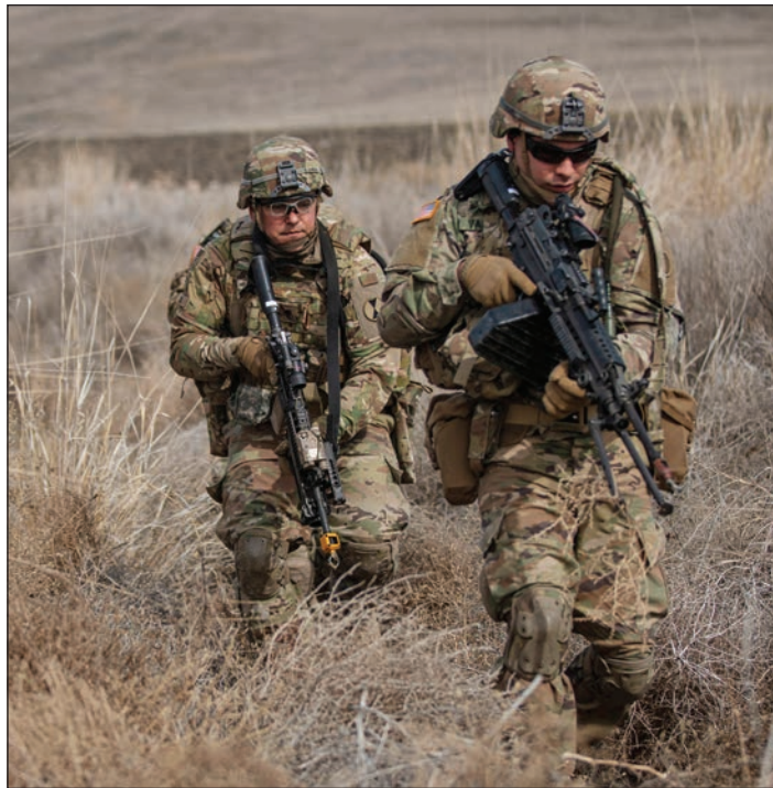
Soldiers in 3rd Battalion, 161st Infantry Regiment maneuver to a new position on 4 March 2021 during training at Yakima Training Center, WA.

each of their exams prior to submission, I found many opportunities to retrain, coach, and guide toward answers that better aligned with mine, which were informed by the battalion commander's priorities. After submitting the exams to the commander, each exam was given timely, specific feedback. This feedback was then shared with each junior officer, highlighting both correct responses and shortcomings in knowledge or application.