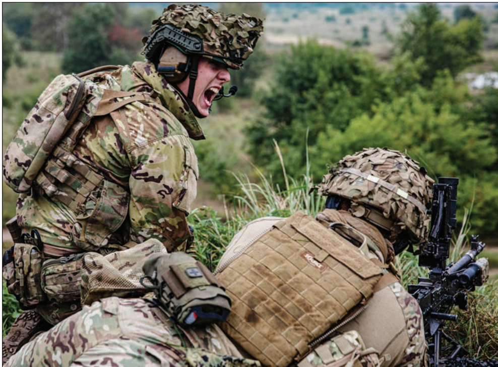
A Soldier with 3rd Battalion, 161st Infantry Regiment calls for ammunition during a training exercise at Bemowo Piskie Training Area, Poland, on 23 September 2021.

Along with shaping the culture through social media, leaders produce unique awards that incentivize the behaviors we desire most in our junior leaders. This comes from community-sponsored gifts that tie our battalion close