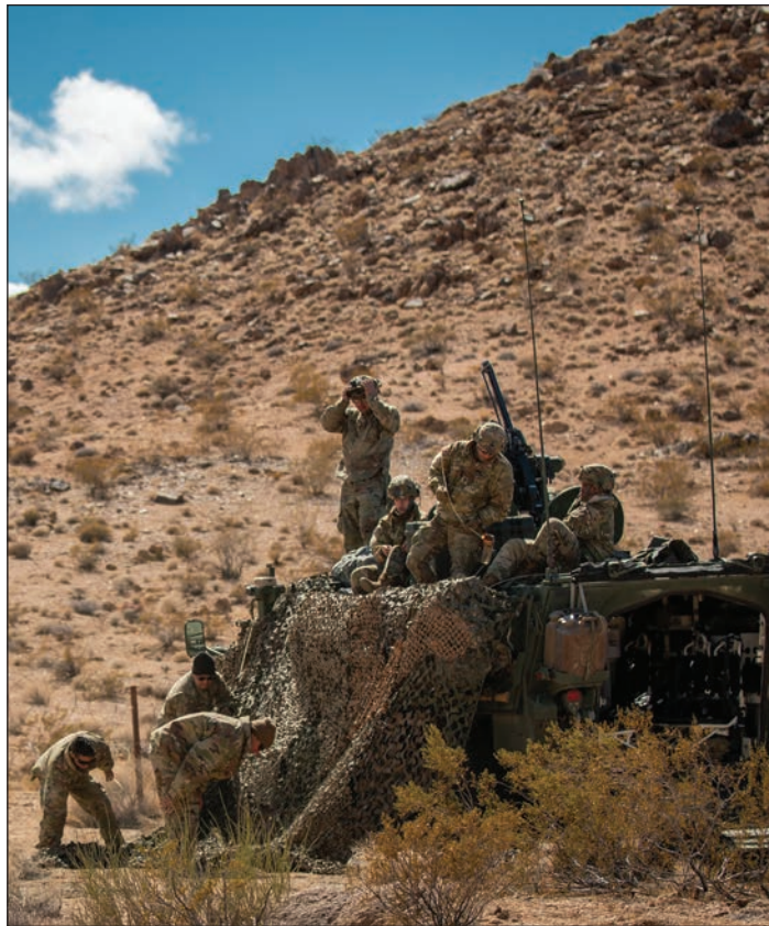
Soldiers in 3rd Battalion, 161st Infantry Regiment camouflage their Stryker vehicle at the National Training Center on 10 March 2021.

2) I would aggressively assume more risk to commit the bronegruppa. The absence of anti-tank assets on the battlefield is not evidence that there are anti-tank assets to be found!